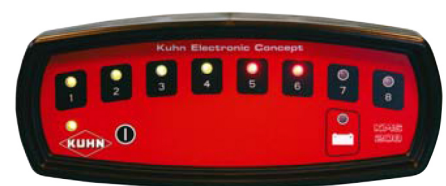
Electronic Control Box

Applicator with non- stop disc for min-tilled fields