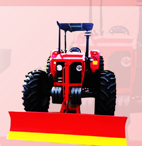
Front Dozer Blade