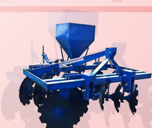
Multi Disc Harrow