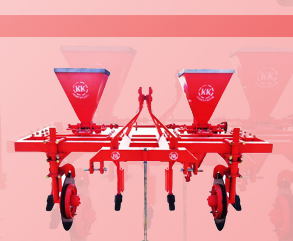
Disc Coultter Fertilizer Applicator

"Agricultural Machinery for Smart Farmers"